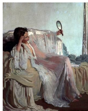
An Eastern Gown by William Orpen