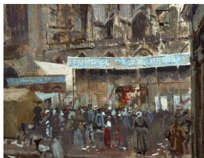
Theatre Of Young Artists by Walter Sickert

The 6 selected artworks can also be viewed online here: