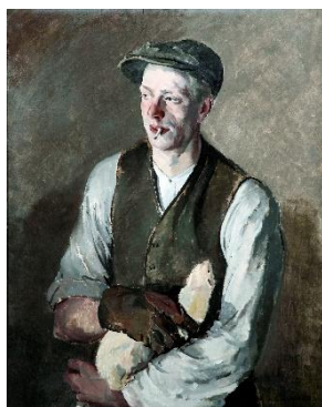
The Ratcatcher by Philip Connard